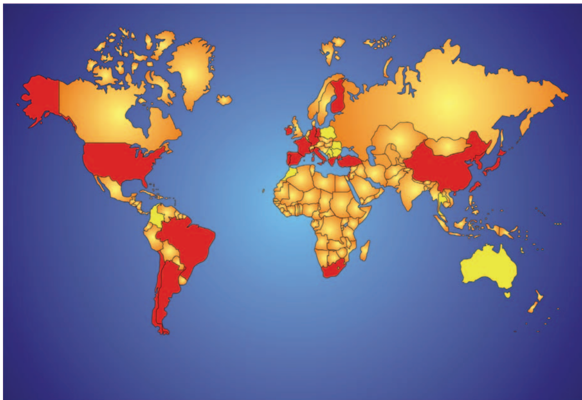
FIG. 2. Countries that have reported an outbreak of carbapenem-resistant Acinetobacter baumannii . Red signifies outbreaks reported before 2006, and yellow signifies outbreaks reported since 2006.

(42, 488). Intercontinental spread of multidrug-resistant A. baumannii has also been described between Europe and other countries as a consequence of airline travel (383, 421). These events highlight the importance of appropriate screening and possible isolation of patients transferred from countries with high rates of drug-resistant organisms.